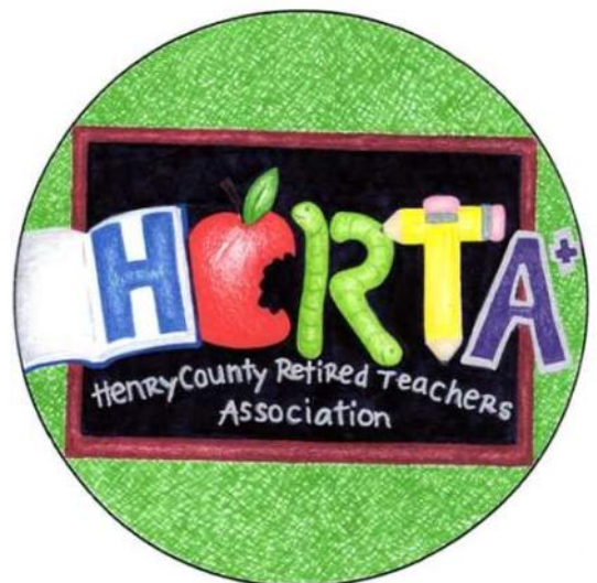
Audrey Keeterle of Holgate High